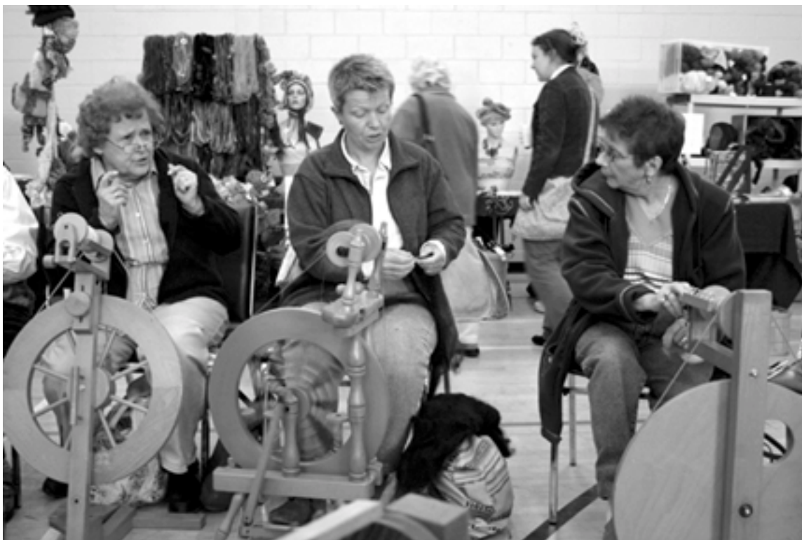
Something to talk about... The Gathering, Port Hope Spin-in April 2006